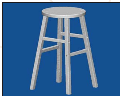
Raw scan of 2 1/2 foot (76.2cm) stool