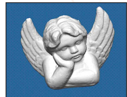
Sample scan result