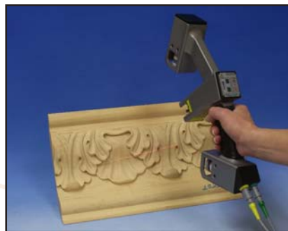
SCORPION scanning wand

The FastSCAN SCORPION™ is a two camera system allowing maximum detail to be captured with each sweep of the handheld scanning wand. Each camera on the wand views the reflected laser line independently which expedites data acquisition. The SCORPION systems extended coverage minimizes data dropouts due to occlusions, particularly helpful when scanning more complex 3D surfaces.